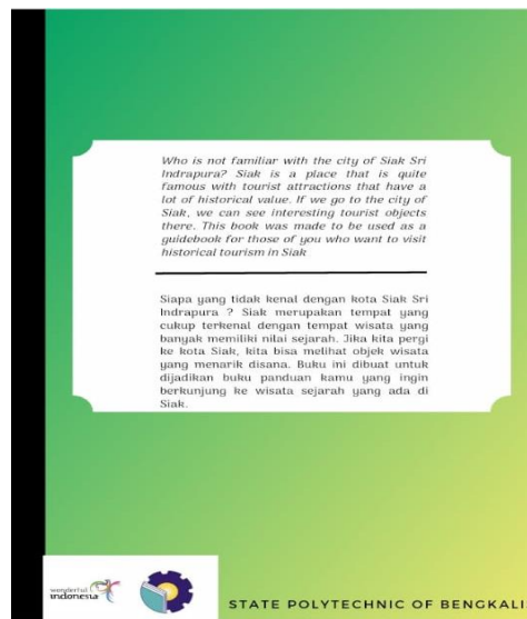
Figure 1.6 Cover Design